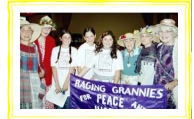
Raging Grannies and friends.